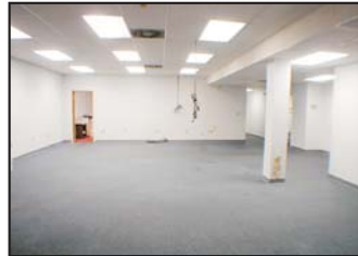
OPEN OFFICE AREA